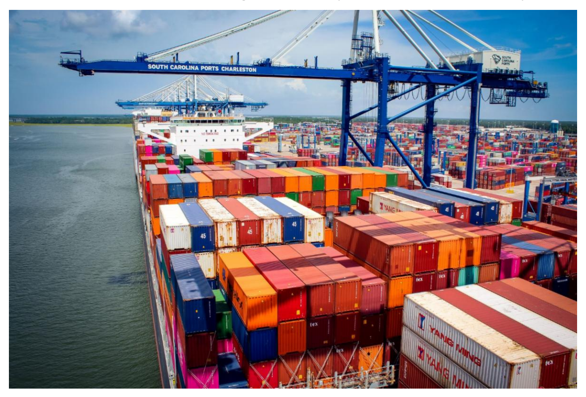
SC Ports reported an all-time container record for March.

CHARLESTON, SC — APRIL 6, 2021 - South Carolina Ports handled the most cargo in its history in March, with the Port of Charleston handling record volumes as the Hugh K. Leatherman Terminal begins operations.